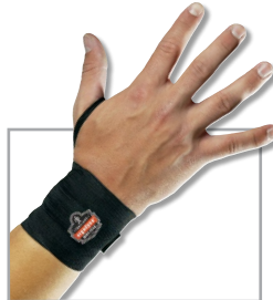
ProFlex® Wrist Wraps

Measure around the smallest part of the wrist.