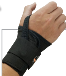
ProFlex® Wrist Supports

Measure around the palm. DO NOT include the thumb area. Use the size chart across the bottom of this page to double check your size choice.