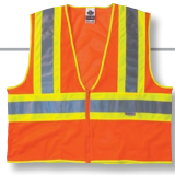
GloWear® Hi-Vis Vests

T-Shirt, Polo Shirt, and Sweatshirt are individually sized S, M, L, XL, 2XL, 3XL, 4XL, 5XL and follow standard sizing.