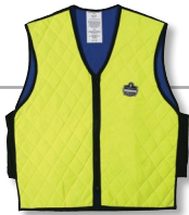
ChillIts® Cooling Vest 6665

Bring tape measure around the widest part of your chest, under your arms, completely around your torso.