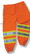
GloWear® Pants 8910/8911

Vests & Vests w/Sleeves are sold in combined sizes: S/M, L/XL, 2XL/3XL, and 4XL/5XL. *Note: 8240HL is available in M/L and XL/2XL only.