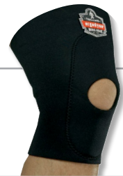
Ergodyne® Knee Sleeves

In a relaxed position, measure around the widest area of the forearm just below the elbow. For best fit, an elbow support should sit about 2-3 finger widths below the elbow crease.