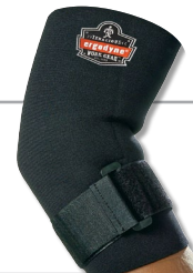
ProFlex® Elbow Supports

Measure around the smallest part of the wrist.