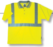
GloWear® Hi-Vis Shirts

T-Shirt, Polo Shirt, and Sweatshirt are individually sized S, M, L, XL, 2XL, 3XL, 4XL, 5XL and follow standard sizing.