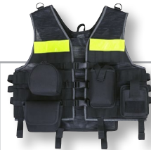
Arsenal® MOLLE Vest

Choose your synthetic belt size based on your pant waist size.