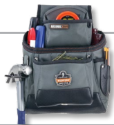
Arsenal® Synthetic Rigs

Bring tape measure around the widest part of your chest, under your arms, completely around your torso.