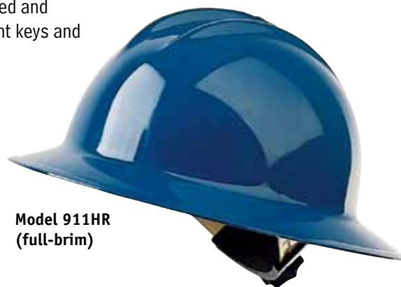
Model 911HR (full-brim)