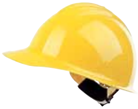
High Heat Series