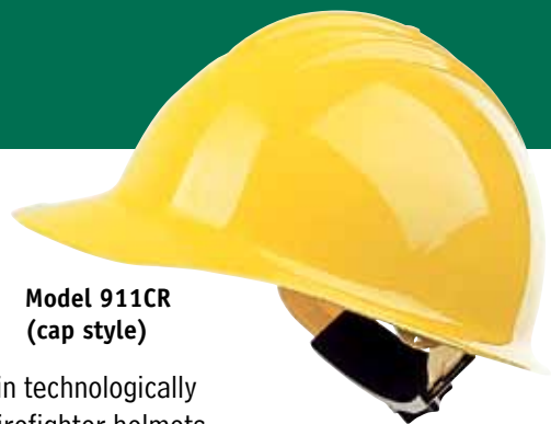
Model 911CR (cap style)

The 911C and 911H helmets meet or exceed ANSI/ISEA Z89.1-2009, Type I, Class E & G requirements.