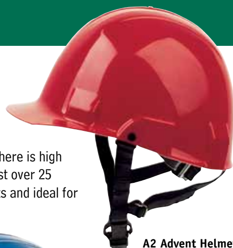
A2 Advent Helmet (with 3-point chinstrap)

Offering lateral and top impact protection, Advent helmets meet or exceed ANSI/ISEA Z89.1-2009, Type II, Class E & G, providing impact protection for the top, front, back and side of the head.