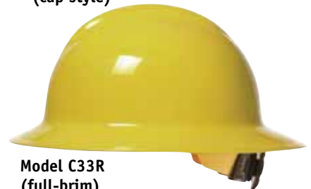
Model C33R (full-brim)