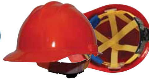
Classic Series Superior Comfort