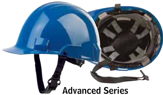
Advanced Series Extreme Safety