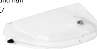
CP2 (clear polycarbonate chin protector)