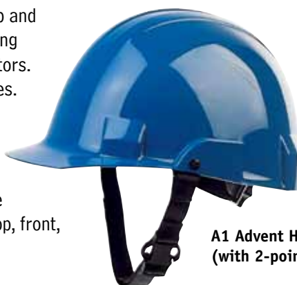
A1 Advent Helmet (with 2-point chinstrap)