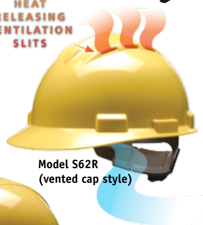
Model S62R (vented cap style)