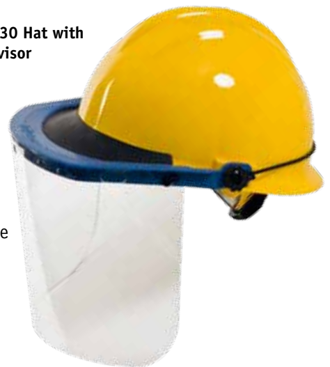
Model C30 Hat with Tritan™ visor