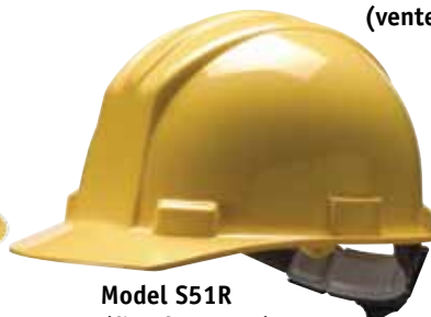
Model S51R (flat-front cap)