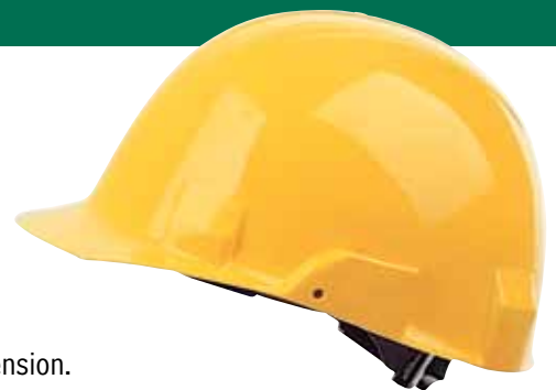
Vector Helmet (with ratchet suspension)

Offering lateral and top impact protection, Vector is nearly as lightweight as conventional hard hats. Vector helmets meet or exceed ANSI/ISEA Z89.1-2009, Type II, Class E & G, as well as CSA Z94.1-2005, Type 2, Class E & G, providing impact protection for the top, front, back and side of the head.