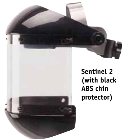
Sentinel 2 (with black ABS chin protector)