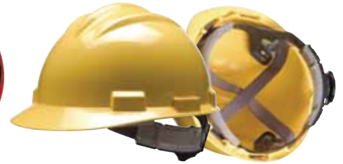
Standard Series Stylish Low-Profile