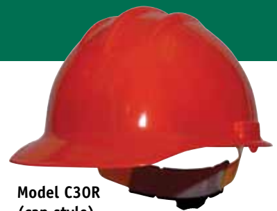
Model C30R (cap style)

All Classic hard hats and caps are made from high-density polyethylene and come equipped with Bullard 6-point self-sizing pinlock or Flex-Gear® ratchet suspension system. Both suspension systems allow for a truly customized and comfortable fit with 1" wide seamless nylon straps, vertical adjustment keys and an absorbent cotton brow pad. All Classic hats and caps meet or exceed ANSI/ISEA Z89.1-2009, Type I, Class E & G requirements. Models C30 and C33 also meet or exceed CSA Z94.1-2005, Type 1, Class E & G requirements. The new, extra-large, C34 provides 12.5 percent more interior space.