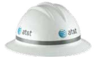
Bullard Logo Shop