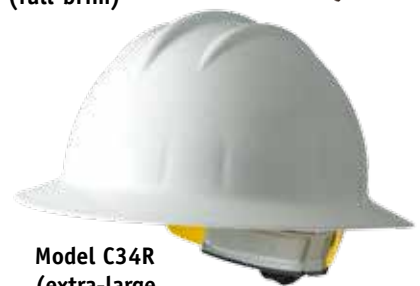
Model C34R (extra-large full-brim)