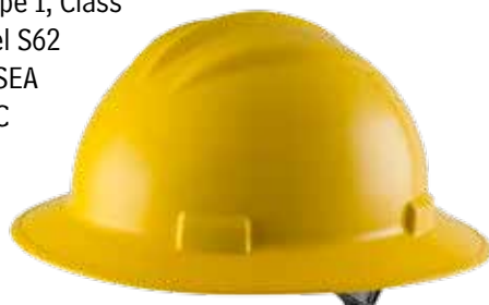
Model S71R (full-brim)