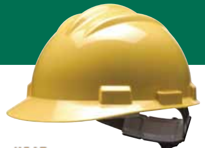
Model S61R (cap style)

Available with either a 4-point self-sizing pinlock or Flex-Gear® ratchet suspension system, Standard Series hard hats offer comfort, vertical adjustment and a snug fit. Made from high-density polyethylene, Models S51, S61 and S71 meet or exceed ANSI/ISEA Z89.1-2009, Type I, Class E & G requirements. Model S62 meets or exceeds ANSI/ISEA Z89.1-2009, Type I, Class C requirements. Model S51 also meets or exceeds CSA Z94.1-2005 Type 1, Class E & G requirements.