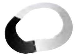
SS5 Sun Shield

Americas: Bullard 1898 Safety Way • Cynthiana, KY 41031-9303 • USA Toll-free within USA: 877-BULLARD (285-5273) Tel: +1-859-234-6616 • Fax: +1-859-234-8987