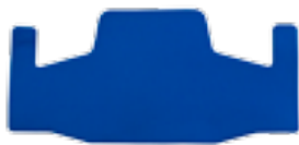
RBPCOOL Brow Pad